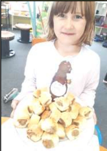
The Gruffalo has visited Pod 1. We tried knobbly knees, black tongues and roasted fox sandwiches. Yummo!